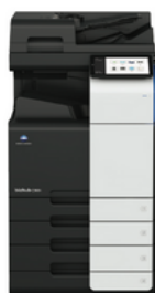
bizhub i-Series C360i