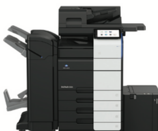
bizhub i-Series C650i