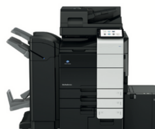
bizhub i-Series 950i