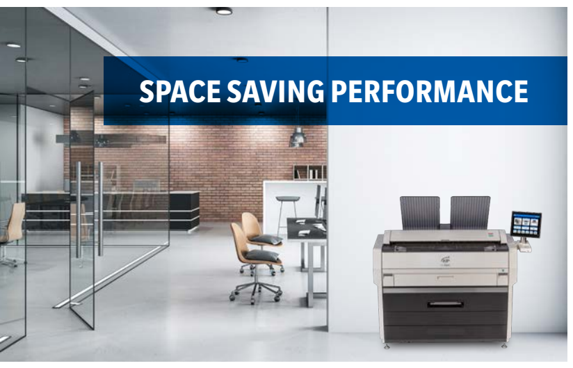
Fits where you need it, including near wall installation