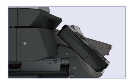
Pivoting Touchscreen offers the viewing angle for any use instantly.