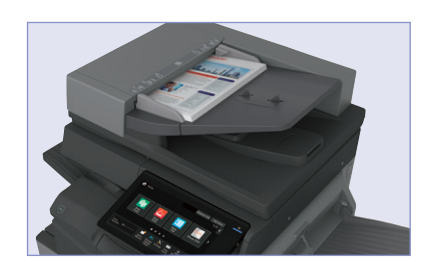
100-sheet RSPF scans documents at up to 80 images per minute.