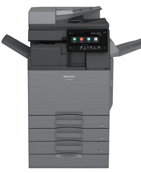
BP-50M65 shown with Inner Folding Unit, Right Side Exit Tray, and 2-drawer Paper Deck.

10.1" (diagonally measured) customizable touchscreen display.