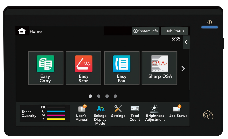
10.1" (diagonally measured) customizable touchscreen display.