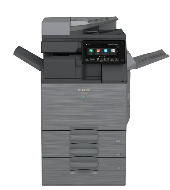
BP-50C45 shown with Inner Folding Unit, Right Side Exit Tray, and 2-drawer Paper Deck.