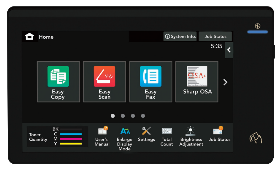
10.1" (diagonally measured) customizable touchscreen display.