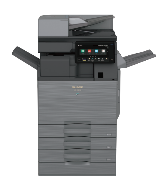
BP-70C45 shown with Inner Folding Unit, Right Side Exit Tray and 2-drawer Paper Deck.